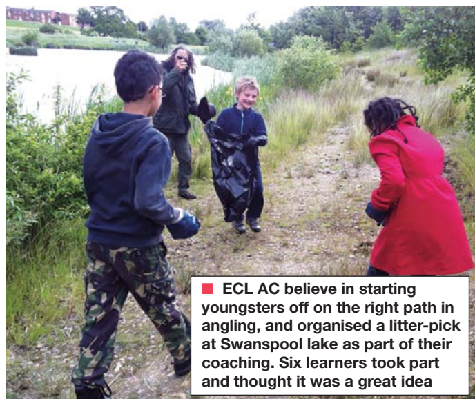
■ ECL AC believe in starting youngsters off on the right path in angling, and organised a litter-pick at Swanspool lake as part of their coaching. Six learners took part and thought it was a great idea